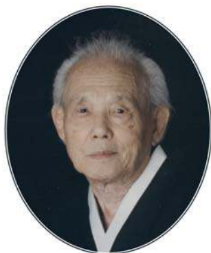
Hwang Kee, Moo Duk Kwan Founder 1914-2002