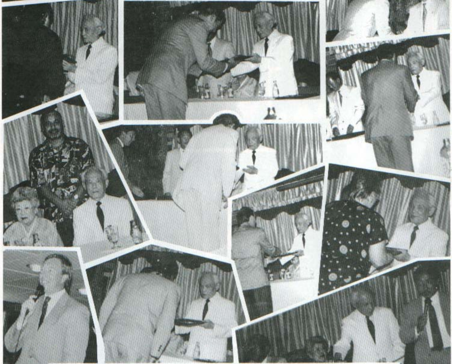
Grandmaster Hwang Kee personally congratulates members of Moo Duk Kwan on a job well done.