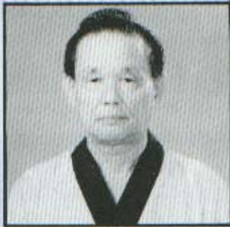
Honorable Grandmaster Hwang Kee Founder of Tang Soo Do Moo Duk Kwan